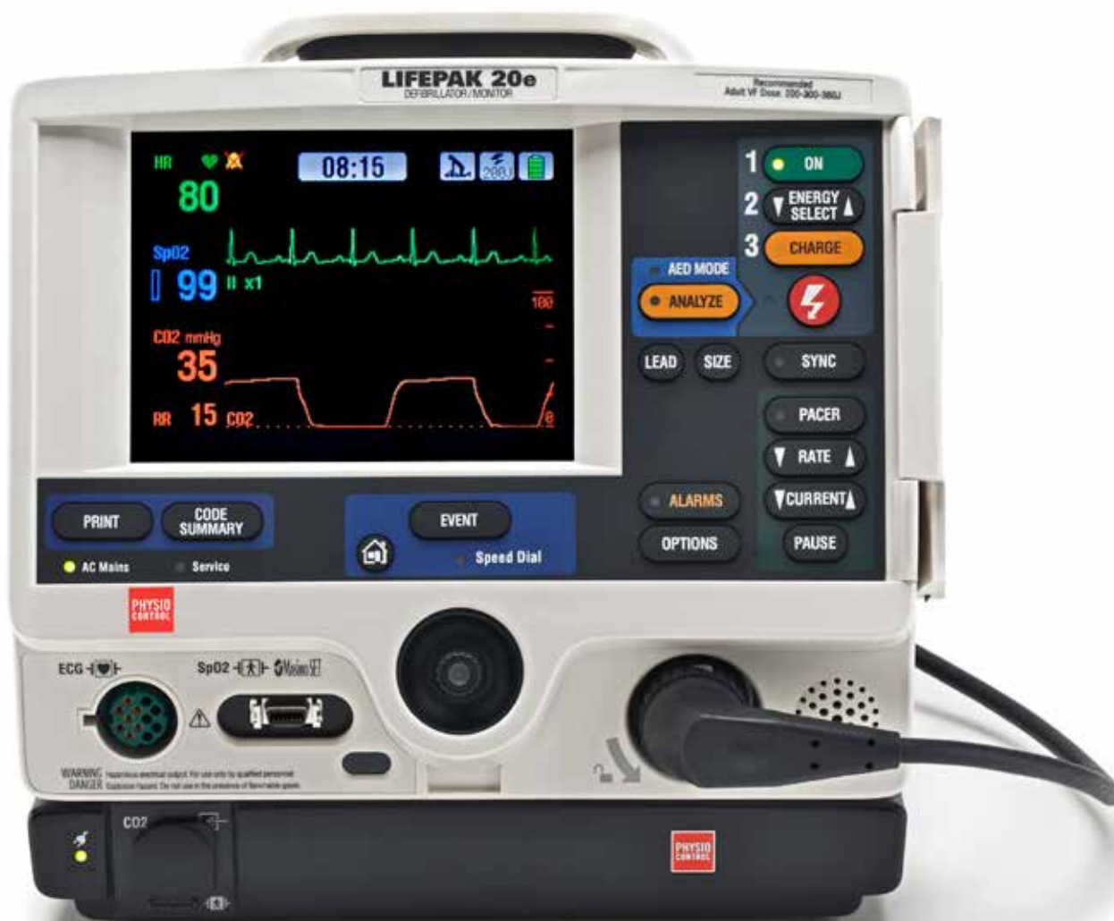
Manual Mode for ALS teams