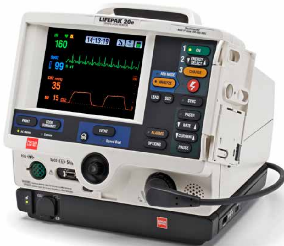
LIFEPAK® 20e DEFIBRILLATOR/MONITOR with CodeManagement Module™