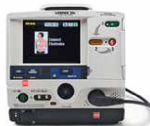
AED Mode for BLS teams